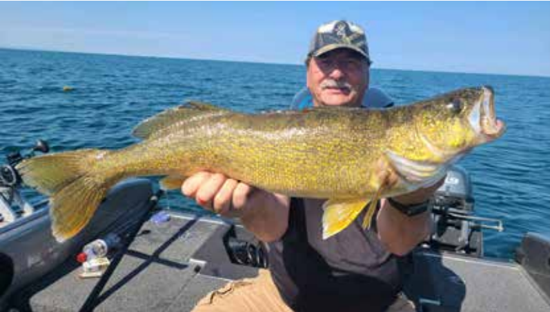
Is this fish as big as it looks?

We all take pictures and even videos now. Fortunately, picture taking has been around now for around 150 years. That is a lot of photographs and a lot of history and memories. Too bad it was not around before that as there is so much that photos could tell. We had to rely on paintings and sculptures to see what things were like before photography. This leaves us with limited images of what the world was really like before we had camer-