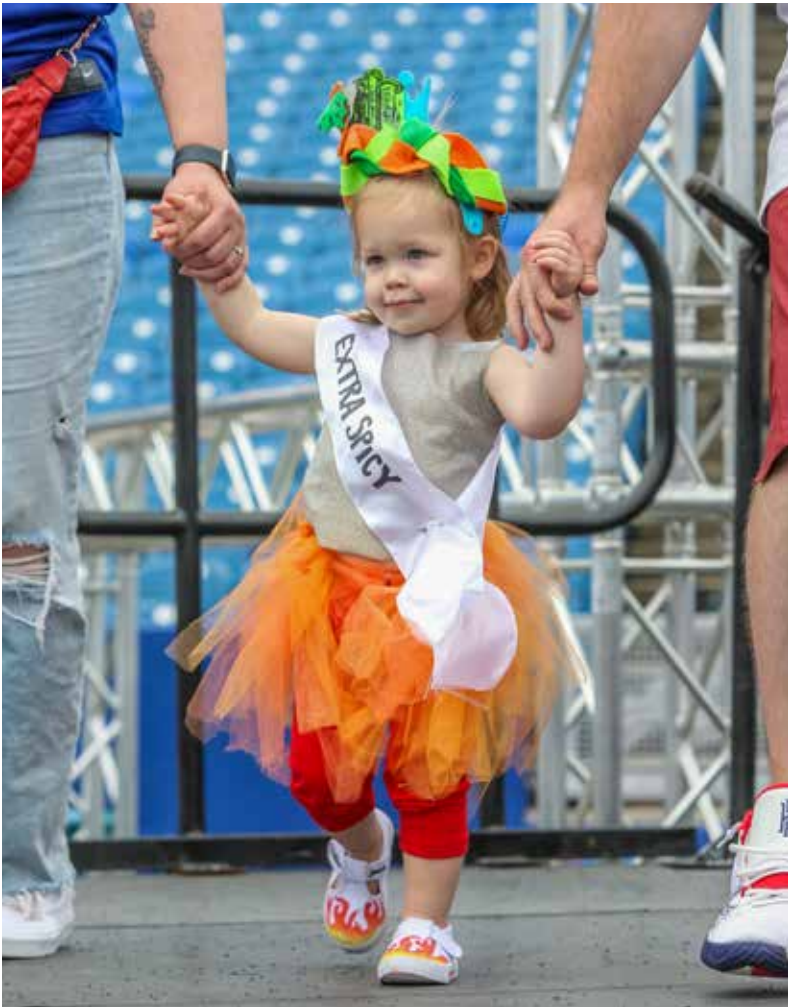
The National Baby Wing Contest event, 2021.

Continued on page six. found a new home. Whether you visit us every year or haven't been in a decade, this is the year to come back, reconnect with old friends over a cold beer and feast on your favorite food, complete with ample helpings of wing sauce and blue cheese."