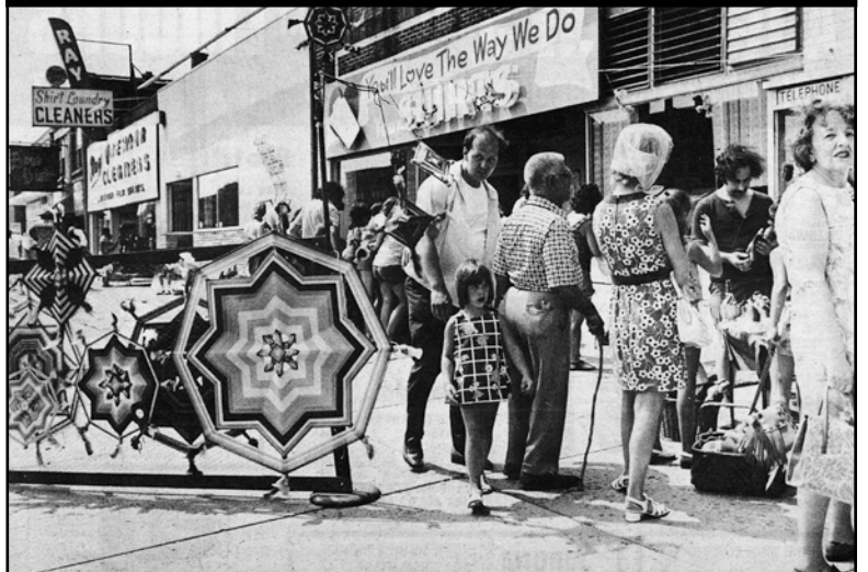
July 1973. INDIAN CRAFTS...Spectators inspect Indian crafts on exhibit.