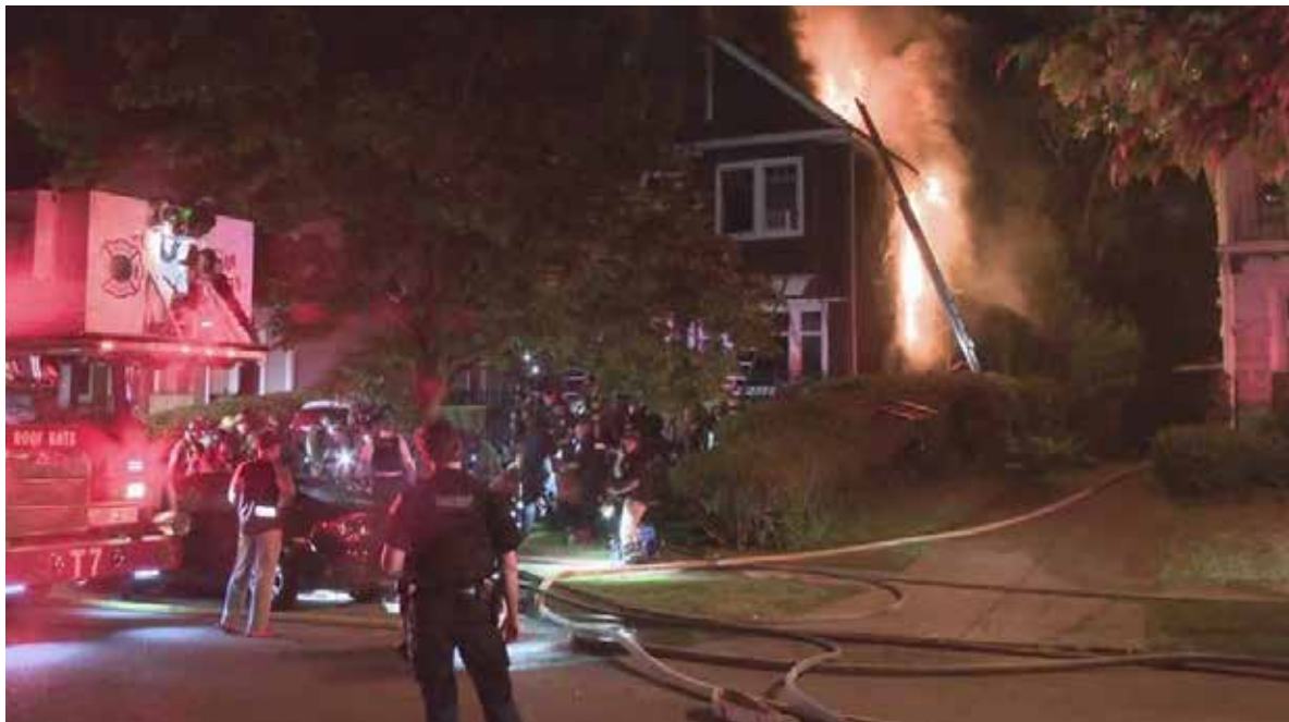
The Buffalo Fire Department reinforces National Fire Prevention Week for its 100th anniversary in their Fire House Open Houses, premiering October 22nd.

Buffalo Fire Department is teaming up with the National Fire Protection Association® (NFPA®) to promote this year's Fire Prevention Week campaign, "Fire Won't Wait. Plan Your Escape™", reinforcing the critical importance of developing a home escape plan with all members of the household and practicing it regularly. In addition, this October represents the 100th anniversary of Fire Prevention Week, the nation's longest-running pub-