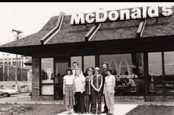
1982. McDonalds comes to the West Side of Buffalo, NY.