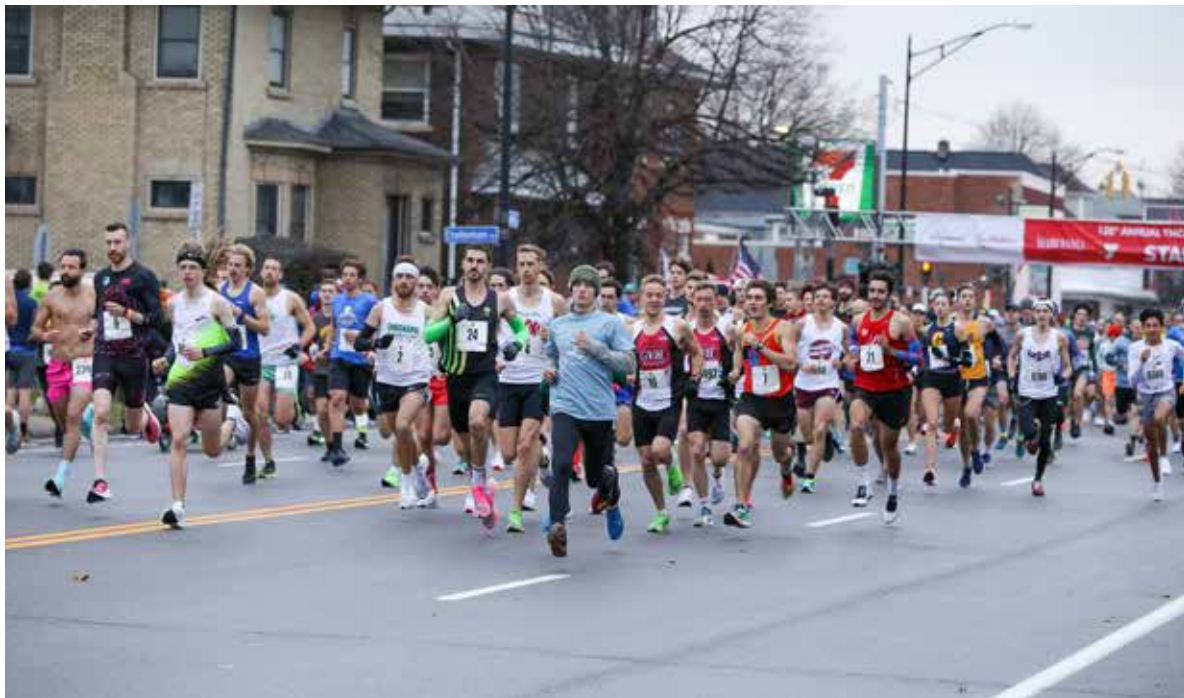
The first of 10,000+ Turkey Trotters begin their annual trek down Delaware Avenue on Thanksgiving Morning 2021.

The Annual YMCA Turkey Trot will be held on Thanksgiving Day, Thursday, November 24. The YMCA Turkey Trot is a time-honored Thanksgiving Day tradition. The oldest consecutively run footrace in the world, the YMCA Turkey Trot is an 8k race that attracts 14,000 runners and walkers annually. Proceeds raised help fund vital YMCA programs and services that empower youth, improve community health, and provide support to our community's most vulnerable.