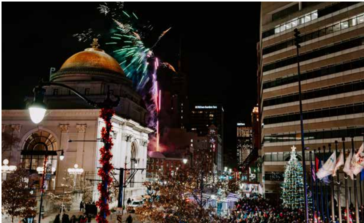
The Buffalo Downtown Christmas Tree Lighting, December 3rd, 2021.

Saturday, December 3, 2022, BankOnBuffalo Presents the Downtown Christmas Tree Lighting Celebration at Rotary Rink at Fountain Plaza. This annual event marks the official opening of the free ice-skating season in the heart of Downtown Buffalo. The 2022-23 free ice-skating season at Rotary Rink is Presented by Ciminelli Real Estate Corporation. The event begins at 5pm with free ice-skating. At 6pm, Buffalo Place and BankOnBuffalo representatives, countdown the lighting of the official tree and fire-