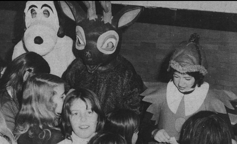
December, 1973. SNOOPY, RUDOLPH, AND MOLLY...invite children from the Delaware YMCA to Saturday’s Christmas Party at the North Park Theatre.