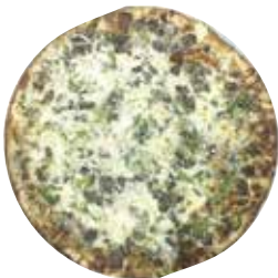
Mister Steak Pizza