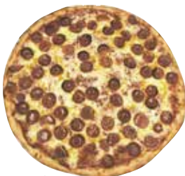
Cheese & Pepperoni