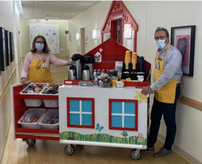
Ronald McDonald Happy Wheels Cart, Bringing RMHC directly to those in need.

Highmark Blue Cross Blue Shield of Western New York and the Buffalo Bills today announced Ronald McDonald House Charities of Western New York (RMHC of WNY) as the Highmark Community Hero for the Dec. 11 game versus the New York Jets. Highmark's Community Hero program shines a spotlight on influential non-profit organizations in