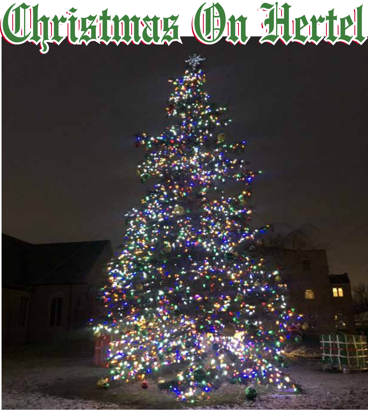
St. Margaret's R.C. Church Christmas tree on 1395 Hertel Avenue and North Park Avenue sponsored by the Hertel Business Association.