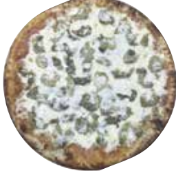
Mister Stuffed Hot Pepper