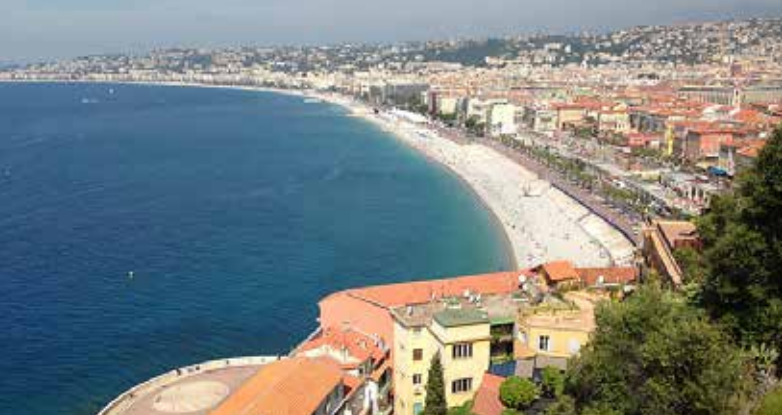
Gorgeous Nice, France.

A few years back my wife and I went on a three week vacation in Europe. We began the trip by flying into Nice, France. We spent four great days with a French friend who showed us the beauty and friendliness of the people of southern France. Nothing like the rude French people in Paris. It was a wonderful four days. The second leg of our trip was a train ride from Nice, France into Rome, Italy. We had a Euro rail pass which meant we could get on any train and go anywhere, anytime, in Europe. We left Nice, France about 8:00 PM. It was about a 11-hour trip overnight, and most of the trip was in the dark. Getting on a Euro rail train for the first time was a new experience. We were warned ahead of time to lock and chain our luggage