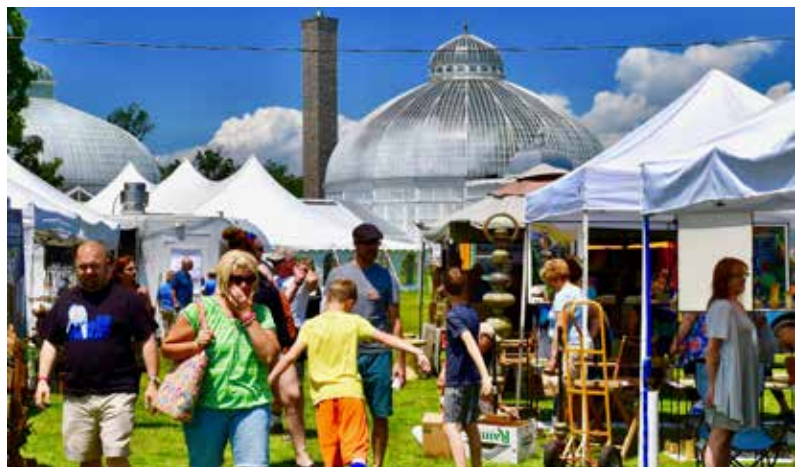
The Buffalo Style Garden Art Sale starts Saturday, June 24, 2023. Application deadline is March 25, 2023.

The popular summer craft sale, to be held Saturday, June 24, 2023 10am-4pm and Sunday June 25, 2023 10am-3pm on the grounds of the Buffalo & Erie County Botanical Gardens. One of the summer's most unique events, the Buffalo Style Garden Art sale takes advantage of Buffalo Niagara's ever-growing and enthusiastic gardening community.