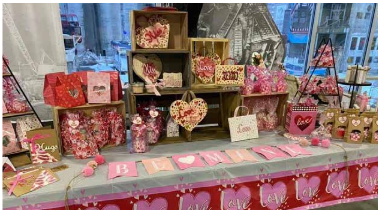
The Totally Sweet Buffalo Winterfest "We LOVE Buffalo" festival of 2022.

Just in time for Valentine's Day, Totally Sweet Events, Totally Buffalo, and Sweet Buffalo, will be hosting a winterfest that highlights so much about what we love about this city. The Totally Sweet Buffalo Winterfest – "We LOVE Buffalo" festival premieres Saturday, February 11, 2023 at the Buffalo RiverWorks, 359 Ganson Street, Buf-