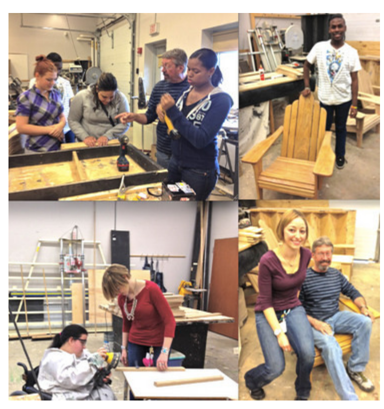
Students from McKinley High School constructed 20 wooden picnic tables and 30 Adirondack chairs for Buffalo Olmsted Parks.

A $5,000 grant from the East Hill Foundation was applied to the purchase of building materials for the construction of 20 wooden picnic tables and 30 Adirondack chairs by Buffalo Public School students for placement throughout the Buffalo Olmsted Parks system. Students from McKinley High School's Careers and Technical Education program (CTE) were responsible for constructing all 20 wooden picnic tables. The CTE program covers many different fields in several different high schools and integrates rigorous academics with relevant career and technical skills, as well as workplace attitudes and behaviors. The Adiron-