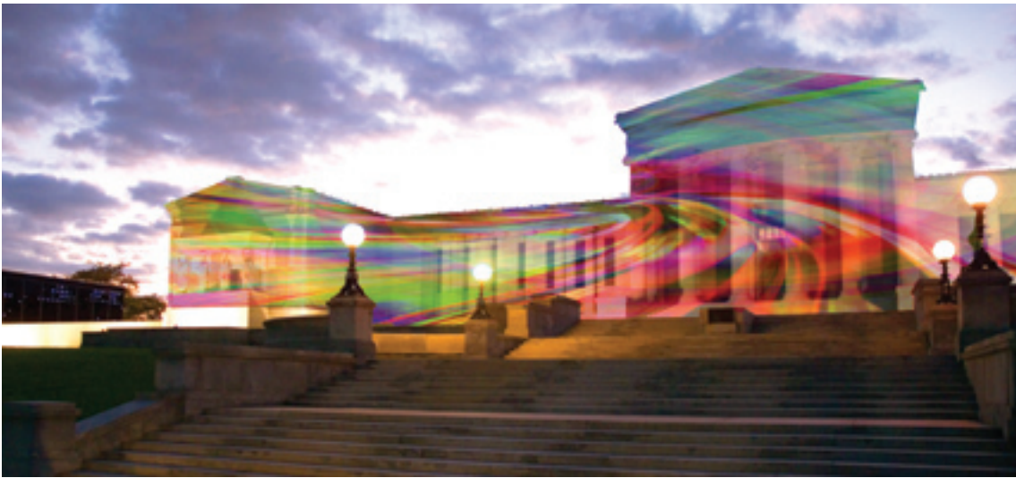
Artist's rendering of the Albright Knox Art Gallery with large scale 3D projections from Illuminate AK, taking place on October 5th.

On October 5th, 2012, Buffalo will experience a spectacle of color and light on a scale never before seen in Western New York. The Albright-Knox Art Gallery will present Illuminate AK, Western New York's first