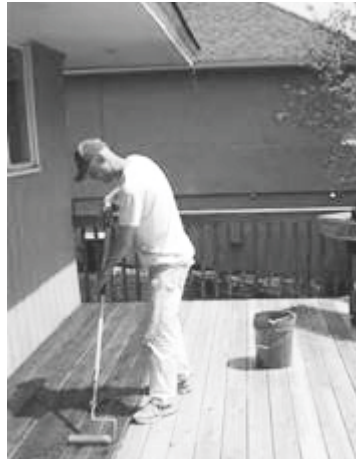
Be sure to choose a top quality coating and the right tools for your wood deck staining project.

If you are thinking about applying a clear fin-