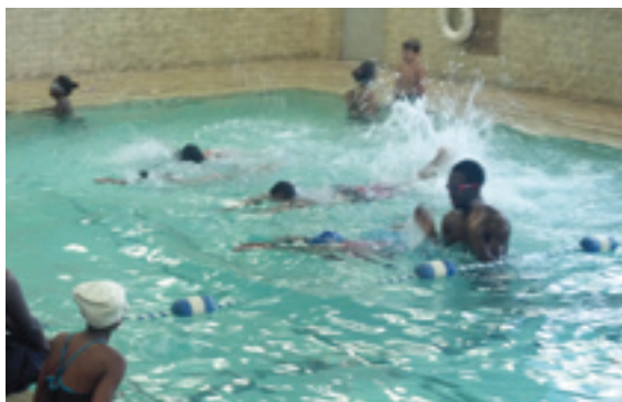
Free swimming lessons are available at City Honors indoor pool for local youth

offered from 4:30 pm - 5:30 pm or 5:30 pm - 6:30 pm,