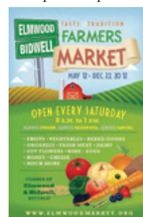
Last year's poster competition winner

Taste & Tradition, Elmwood-Bidwell Farmers Market, May 11 - Dec. 21, 2013, Open Every Saturday, 8 A.M. to 1 P.M., Always Fresh, Always Seasonal, Always Local, Fruits, Vegetables, Baked Goods, Organics, Fresh Meat, Cut Flowers, Wine, Eggs, Dairy, Honey, Cheese, Much More, Corner of Elmwood & Bidwell, Buffalo, and www.elmwoodmarket.org.