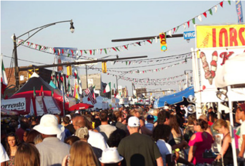
The Sorrento Cheese Italian Heritage Festival of Buffalo moves to the first weekend in August.