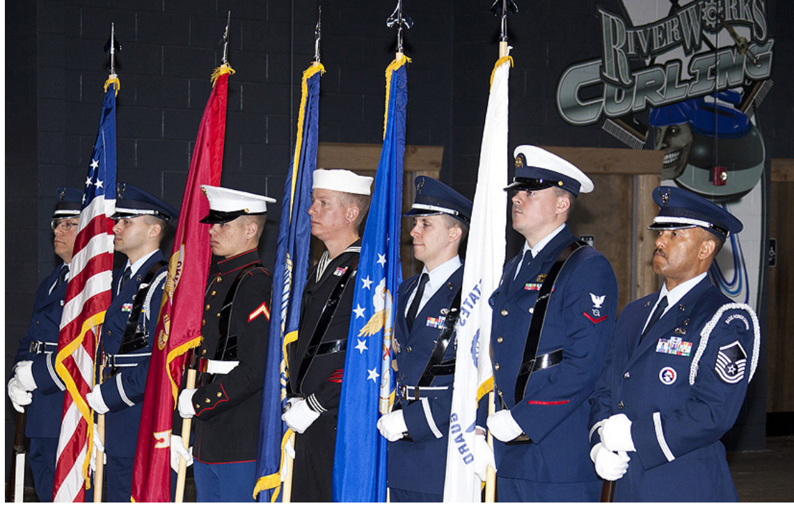
Opening ceremonies commence at noon on Sunday, May 7th, at Buffalo RiverWorks.

The 57th Annual Western New York Armed Forces Week celebrations will be held May 7th - 13th. The week-long festivities will be hosted this year by the United States Air Force in trib-