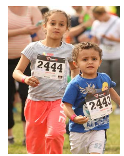
Free event will include a mini-dash for children ages 2 to 5.

"We expect thousands of Western New Yorkers