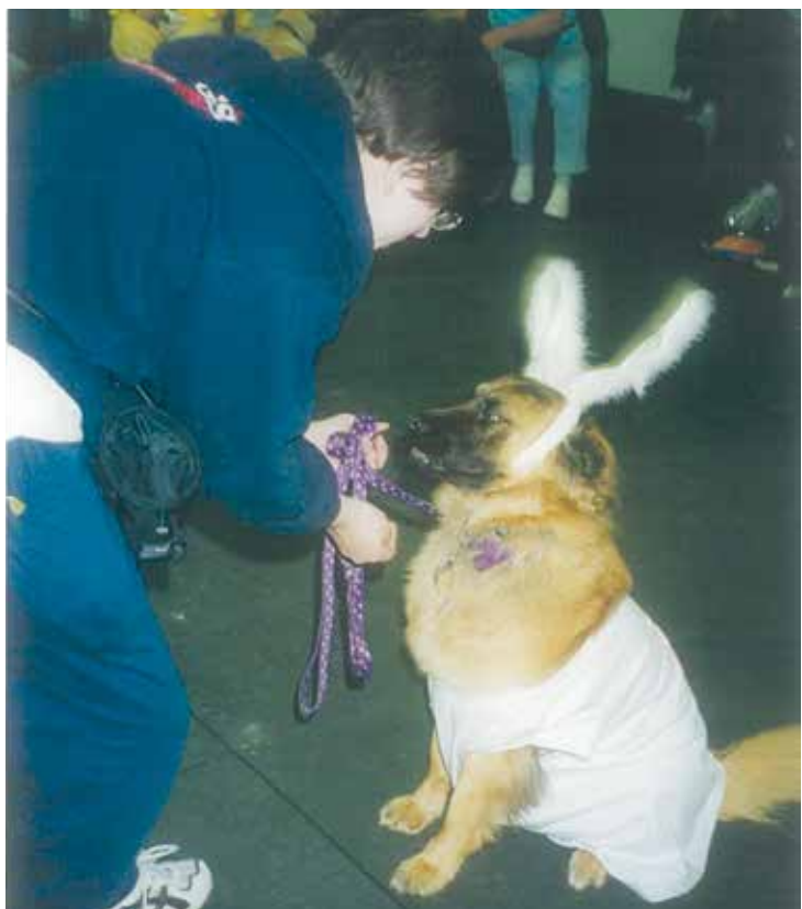
"But I do not want to be a bunny" Taken at an Easter Egg Hunt around 2002.