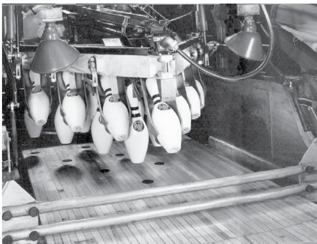
AMF automatic pinspotter.

the family of the man who owns many of the patents for the AMF automatic pinspotter. He had been working on some designs for the pinsetter before he started working for AMF (American Machine and Foundry). I had seen some wooden replicas he had made in his attic of some of his designs. He did not have the resources to develop such a gigantic undertaking. So, he ap-