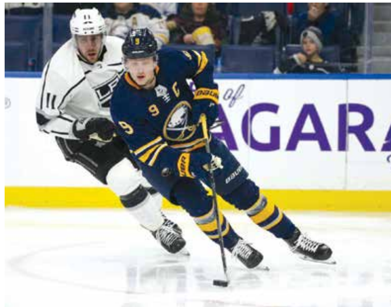
Eichel vs LA Kings.