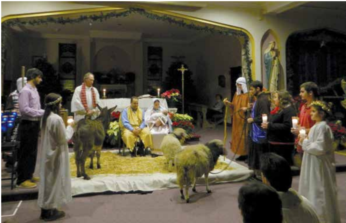
Holy Spirit once again will host a Living Nativity on Christmas Eve.

At the 11:00 pm Mass on Christmas Eve (Monday, December 24th) sheep, a donkey, shepherds and angels will come into Holy Spirit Church (85 Dakota