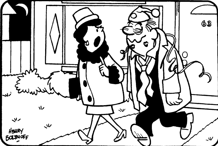
Differences: 1. Moon is missing. 2. Streamer is longer. 3. Coat is different. 4. Horn is missing. 5. Shutters are added. 6. Number is transposed.