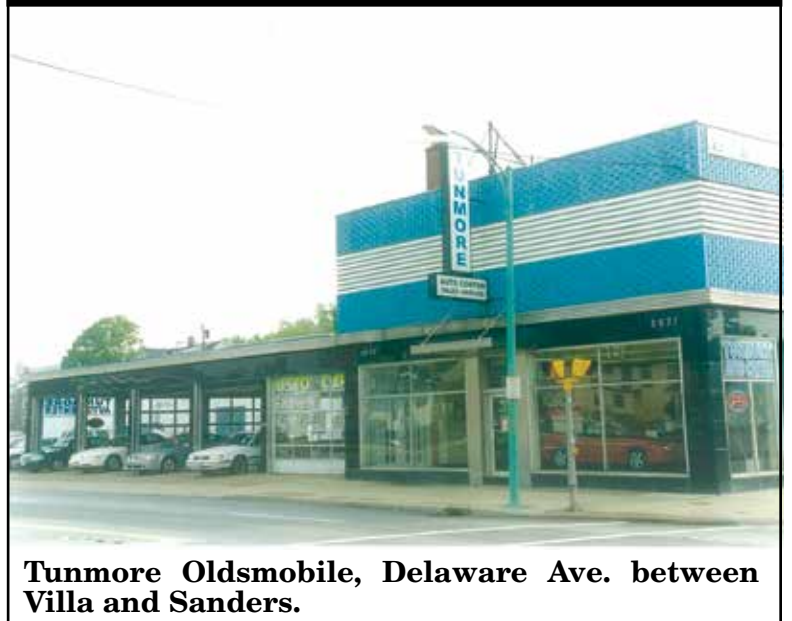
Tunmore Oldsmobile, Delaware Ave. between Villa and Sanders.