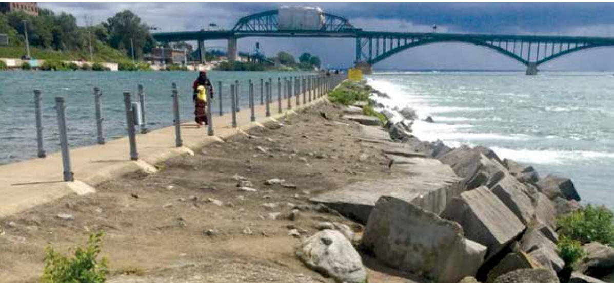
The Bird Island Pier today is now the Nowak Pier named after the congressman who acquired the Federal funds necessary to rebuild it into a safe walkway out into Lake

Erie. The mile walk out onto the pier has become a Buffalo Tourist attraction. A must see to visitors. You see the rushing turbulent water of the Niagara River on one side, and the serene calm waters of the canal on the other. You may even see a large ship pass. You can hear the thunder of the trucks and cars over head as you pass under the Peace Bridge. Out far enough you can see the Buffalo skyline. Across the river you can see the old fort at Fort Erie. Terrific view.