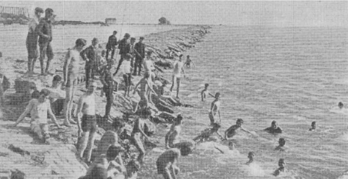
Back in the 1920's the pier was used for fishing and swimming. Notice no Peace Bridge but you can see the grain elevators and even the water intake near Bird Island.

Back in 1860 a small island existed out in Lake Erie called Bird Island. In order for ships to pass safely from Lake Erie into the Black Rock Channel and then into the Erie Barge Canal, it became necessary for a breakwall to be built. This wall would separate the raging Niagara River and form a calmer waterway easier for large barges to navigate. This breakwall was constructed from the southern tip of what was then called Squaw Island out to this tiny island. Hence it was called the Bird Island pier. Mostly constructed of huge rocks and concrete just randomly dumped with no design. All it was intended to be was a breakwater. That it was for years. It had no other use except for being a good fishing spot and a place to swim.