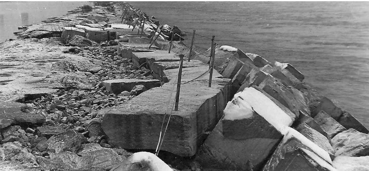
This is what the pier looked like in the 70's. It was this way when I was a kid. Still we ventured out on it as it was a great place to swim (if you were a good swimmer) and fish. Caught lots of yellow pike out a little further than the bridge. It was dangerous as some times the water would pour over the wall in low spots leaving fishermen trapped out on the wall and needing to be rescued. It was still worth it.