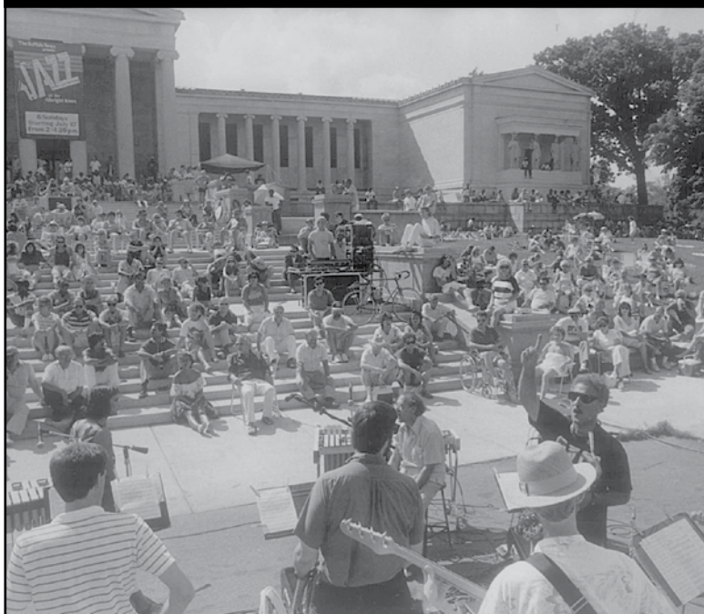
Jazz Festival, 80's, held on the steps of the Albright Art Gallery. Were you there?

WESTERN NY RAPID TESTING SITES CALL 1-833-697-8764