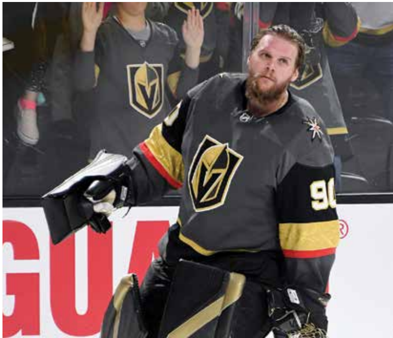
Robin Lehner Las Vegas Golden Knights.

After failing to reach an agreement for a second season the Islanders, Lehner signed a one year contract for $5 million with the Blackhawks as a free agent on July 1. He led the NHL in save percentage for much of the first half and finished tied for ninth blocking 92% of the shots he faced.