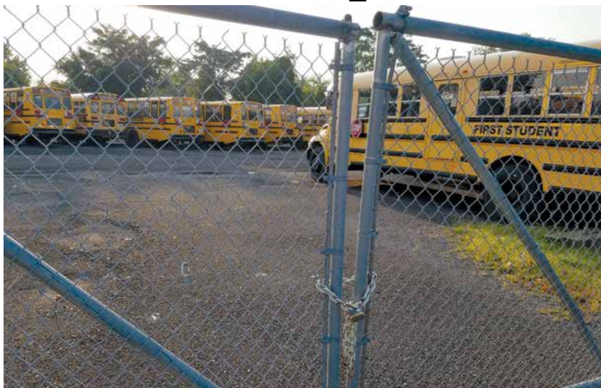
School buses remain parked as students who would be transported to schools are learning from home.

The Buffalo Public Schools (BPS) set plans for a safe and successful 2020-2021 school year in these unprecedented times, and have approached this work thoughtfully, collaboratively and with an enormous sense of responsibility for the health and well-being of the students, families, and staff. They are also planning in a sea of uncertainty. The coronavirus itself, guidelines and policies from health agencies, continue to evolve.