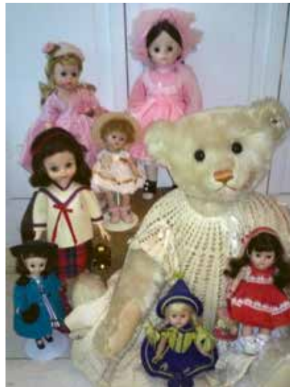
This year's event will feature antique and collectible dolls, bears, miniatures and related items.