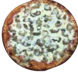
Mister Stuffed Hot Pepper

ALL PIZZAS COME ON OUR FAMOUS 12" BRICK OVEN DOUGH • ALL PIZZAS CUT IN 6 SQUARES