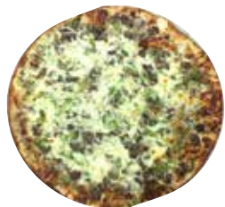
Mister Steak Pizza