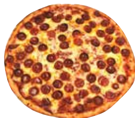
Cheese & Pepperoni