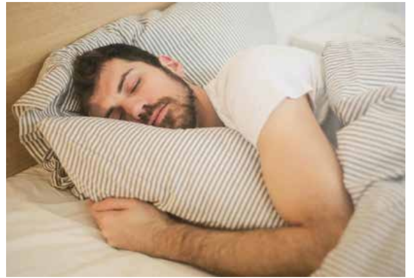
People typically have multiple dreams each night that grow longer as sleep draws to a close.

I am sure everyone enjoys the visits in their dreams from loved ones who have passed on. I do so like those kind of visits and even after forty some years still, on occasion, find myself with my mother or father in some kind of crazy situation. No matter how bizarre it is, it is still a visit. Remember we cannot control our dreams and what happens in them, happens. Who knows what evil and good lurks in the minds of men and women. Try dreaming and find out.