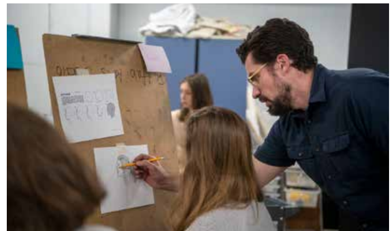
The Buffalo Arts Studio begins "Arts in Healthcare Symposium", on October 19th from 9:30 - 11:30 am.

For more information, visit: https://www.buffaloartstudio.org