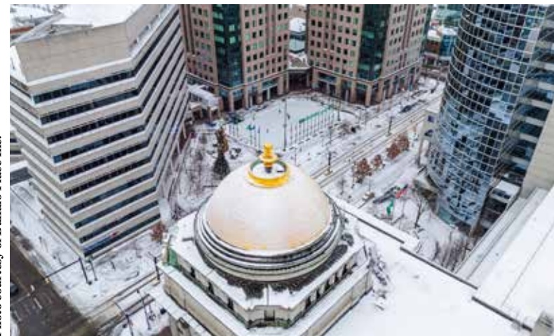
2024-25 Free Ice-Skating Season at Rotary Rink Presented by Evergreen Health.

Friday, February 14, 2025 Evergreen Health will present a Valentine's Sweetheart Skate at Rotary Rink at Fountain Plaza. Evergreen Health serves as Presenting Sponsor of the 2024-2025 free ice-skating season at Rotary Rink. Rotary Rink is located in the heart of Downtown Buffalo, Main Street between Chipewa and Huron Streets, and surrounded by many of Buffalo's architecturally significant buildings.