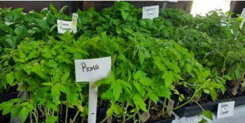
Great plants at great prices from the gardens of Master Gardeners.

The Cornell Cooperative Extension of Erie County (CCE Erie) Master Gardener Program will hold its 14th Annual Plant Sale, Friday, May 23rd from 8:30am to 3:00pm, and Saturday, May 24th from 8:30am to 2:00pm at the First Presbyterian Church of Buffalo, One Symphony Circle, Buffalo, New York 14201.