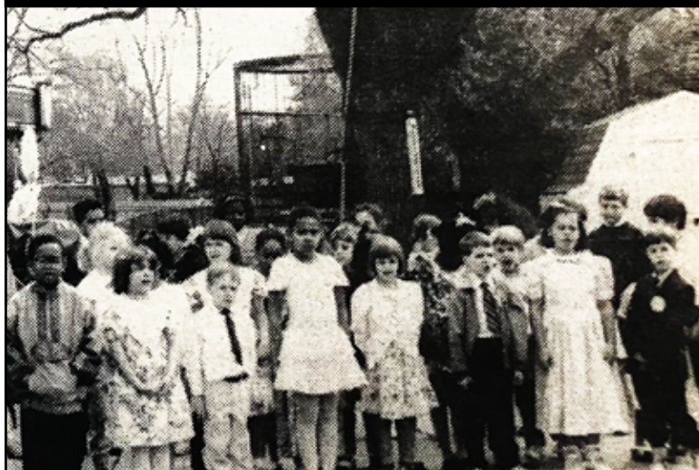
May, 1992. MOTHER AND CHILD PEACE DAY CELEBRATED AT ZOO...Students of School 64 and the Frederick Law Olmsted School sing about peace at the Buffalo Zoo.