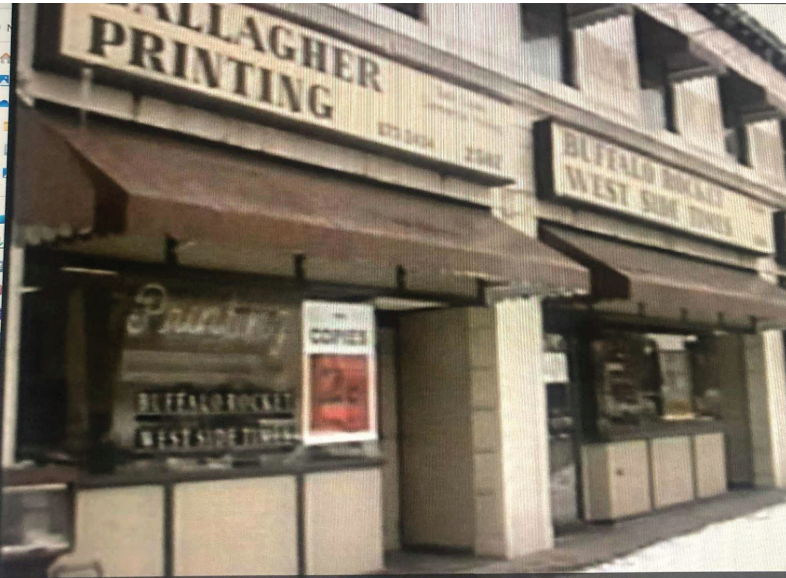
2507 Delaware back in the glory days. Remember this?

One of the things that I like to do on the internet is X or formerly Twitter. You can use a fictitious name and mostly say what you want to say, within reason of course. I have been shut off twice not knowing its policies. Nothing bad, just expressing tongue in cheek posts. One of the things I do like in that venue is the check questions some of the posters ask. One that caught my attention was, “What do you find more valuable to you than money?” To me the answer was easy. I made a comment showing just how I feel. At my extended age, I find my memories are more precious than wealth. I am