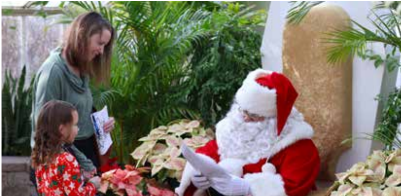
Santa reads a letter during his visit to the Botanical Gardens during the Poinsettia Exhibit.

The Buffalo and Erie County Botanical Gardens has filled their calendar with magical holiday experiences that will create